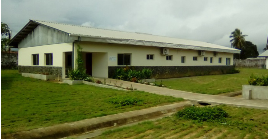
Trinity Dental Clinic

Then, with the curriculum agreed, we are planning to create a library of pre-recorded lectures to facilitate the training course. We are looking for a UK based lecture co-ordinator plus volunteers to record lectures along the lines of, and at the level of, the Teeth Relief Oral Health Manual (see www.teethrelief.org.uk/teaching-material ).