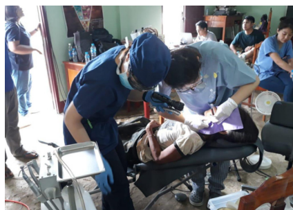
Dentists at work

This is just a snapshot of some of the ways in which InterServe International is involved in seeking opportunities for dental professionals to use their skills alongside others in which the gospel can be shared both in word and deed. Of course, there are many opportunities that arise throughout Asia and the Arab World and not only long term. There are a number of opportunities for people to be