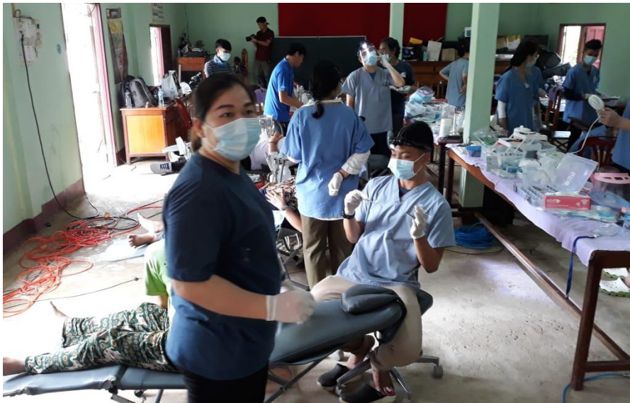
A busy day in the surgery

General dentistry, by which one dentist takes care of 90% of your dental needs, has been proven the most economical and practical way to care for your teeth. We know that is an obvious statement but there are many places in the world where this is not the case.