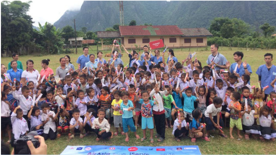
Children showing off their new toothbrushes

involved in a short-term but regular way, working for 3-4 weeks per year, supplementing the medical staff already present undertaking either specialist surgical roles or mentoring and training others. And now, with the advent of “everyone working on Zoom”, there are opportunities to mentor dentists online.