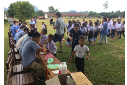
Children lining up to be checked

While the non-profit clinic, which is reliant upon donations, focuses on low- to middle-income patients, the for-profit clinic targets higher-income patients. This not only helps them to cover their overheads, but the resulting financial independence and profit makes it possible to invest in activities such as education and support of the original clinic.