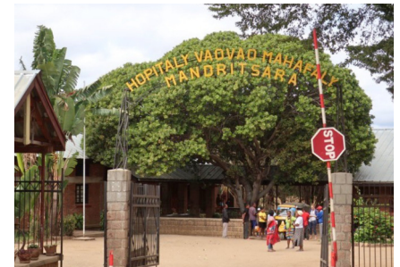
The entrance to the Good News Hospital, Mandritsara, Madagascar

was often due to the Community Health teams going out into remote villages. Sometimes they get a request to go to a distant village and are expressly asked not just to bring better health but to tell them of the Jesus that has made such a difference in another village. Many people have been delivered from lives in the grip of ancestor worship and fear of spirits to a life of joy and peace. Apparently the children of Christian families often do better academically, and get into tertiary education in a way others don't. Not that that is everything, but it shows it makes a radical difference.