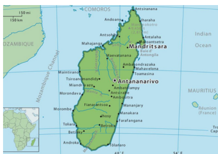
Map of Madagascar