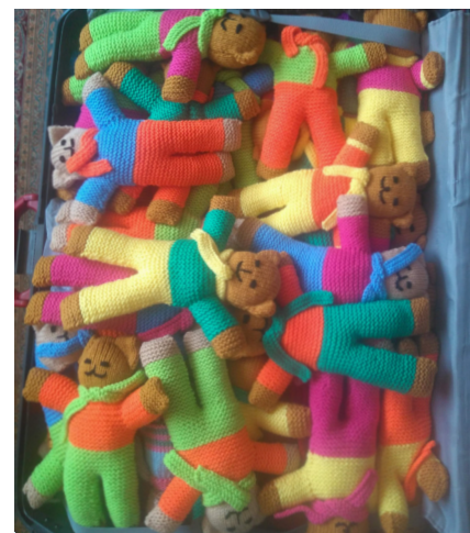
The packing with bears protecting the equipment!