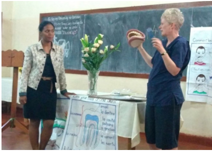
Teaching at the weekly staff meeting.

aim when spitting in a bucket during any treatment before that point. There were no wipes, sprays or disposable bibs or cups. Alcohol and gauze was adequate. I had to ask for clean, filtered water for rinsing and syringing (the fast speed drill had no water coming through) and it was brought in an old Coke bottle, which was amusing!