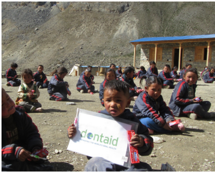
250 toothbrushes and fluoride toothpastes were distributed