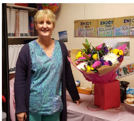
My last day of clinical dentistry

tough times when we think “What I am doing and why?”. Queen Esther was able to face the difficult times she faced because God showed her that “for such a time as this” she was in the right place at the right time for God’s purposes.