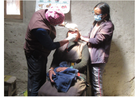
69 patients' teeth were extracted