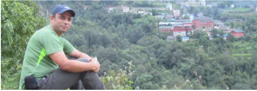
UMN Okhaldhunga Community Hospital from a distance