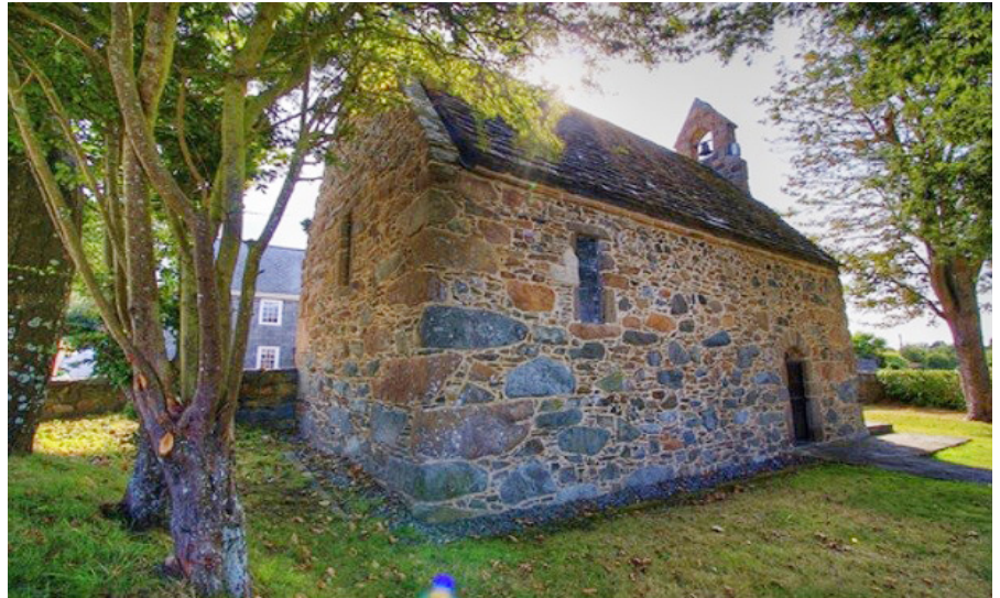
St. Apolline's Chapel