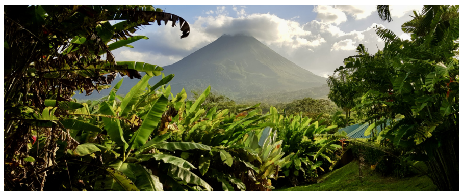
Arenal Volcano on a clear day

We trust our sat navs (well, most of the time!) but how good are we at trusting and