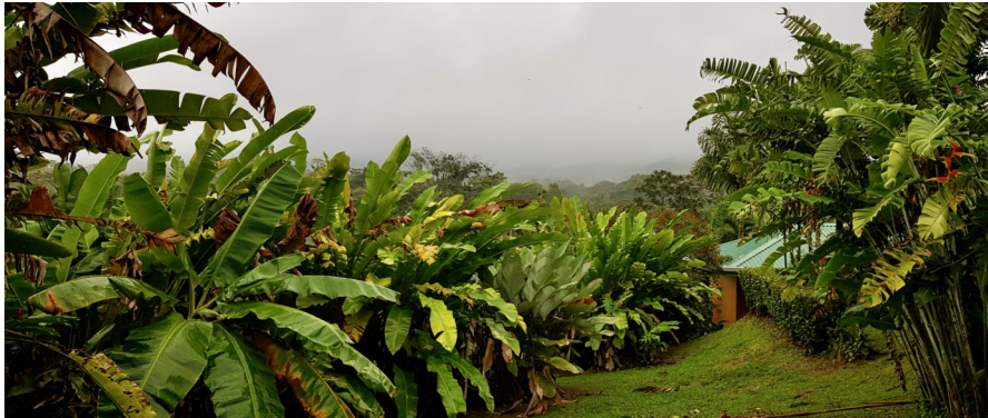
Arenal Volcano shrouded in clouds

Decisions are hard, even life-changing. We often find ourselves wanting guidance. Life can be a series of crossroads with different turnings, perhaps not even sure if we need to turn around and go in a different direction. Should you be stopping doing something, saying yes to persevering or doing something new? Or are you just plain confused?