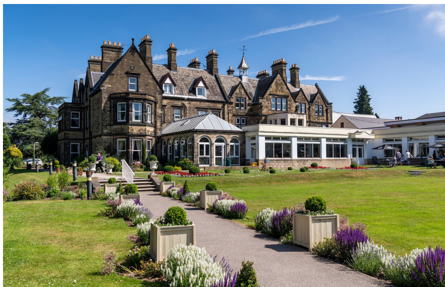
The Hayes Conference Centre

Our family conference this year is in Derbyshire at the Hayes Conference Centre in Swanwick, Derbyshire, from the Friday 13th to Sunday 15th of October. We hope to see many of you there, especially if you are new to conference.