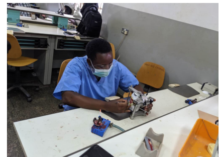
Studying Dental Laboratory Technology