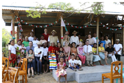
The medical team: missionaries from the UK, Canada, Australia, Switzerland and Malagasy doctors and families on Independence Day

Mandritsara is a small, rural town (population 25,000) in the Northern Highlands of Madagascar. 25 years ago there was no hospital for the area and