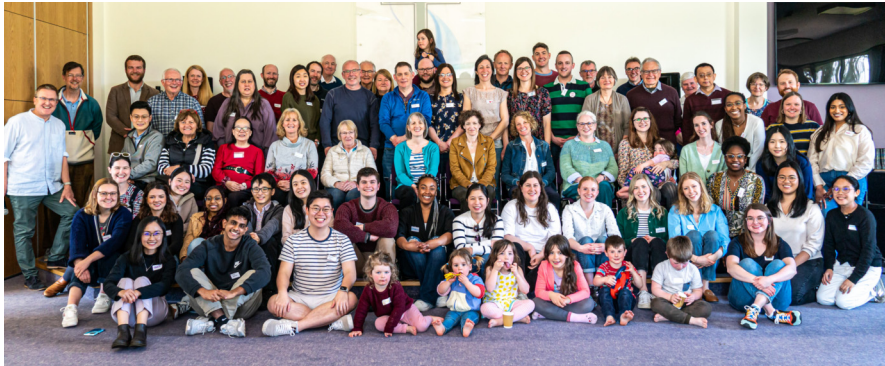
CDF Scottish conference

On Saturday 22nd April, 65 Christian dentists, DCPs, retirees and students gathered in Perth's Madoch Centre for the CDF annual Scottish conference.