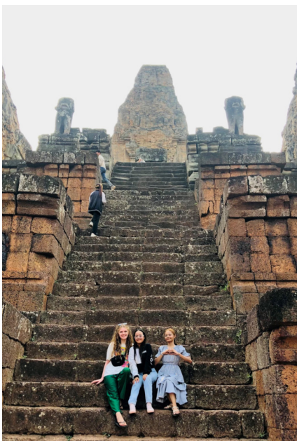
Visiting Pre Rup temple

Just how much I value soft skills as a clinician! I've known since starting my course that my interests lie far more in building and maintaining strong patient relationships than constructing restorations with perfect aesthetic detail. However, it was only on coming to a new country where my verbal communication was all but taken away from me, bar a few choice phrases, that I was able to appreciate just how much of an impact being able to verbally interact with my patients has - on my role as a dentist, and also job satisfaction! The role of communication falling primarily onto the rest of the dental team forced me to focus on my clinical skills, and while I found it difficult to battle with feelings of inadequacy (especially surrounded by other much more proficient Cambodian students), the experience was a great chance to reflect on how much greater the role of a dentist is than the physical job on hand, and the importance of non-verbal communication in building understanding and rapport. It has shown me that I'd love to focus on a role where patient relationships are paramount (maybe community dentistry or special care), but also that I'd love to return to Phnom Penh in the future with a set of vocabulary that extends past 'open your mouth please' and 'spit'!