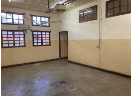
My dental surgery

a surgery (Dentaid have been a marvellous support; if you ever want to upgrade your surgery do let them have your old stuff!). A room has been