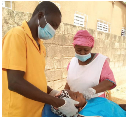
Dental work in Burkina Faso

“The two dental teams here in Burkina thank you for the finance so generously provided by CDF that enables the work to continue. They are bringing pain relief and the gospel to many who are surviving in very dangerous places. The Northern team have struggled with a lack of materials recently, as jihadists have blocked off the main routes to the north of the country. Please pray this will be resolved soon. They recently trained in Christian trauma healing counselling, as they noticed that most of their patients