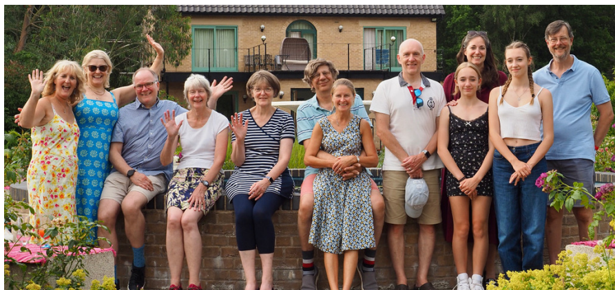
CDF Council Vision and Retreat Day

Please think of joining your local group and organising an event. In particular we have a great opportunity for a London-based event.